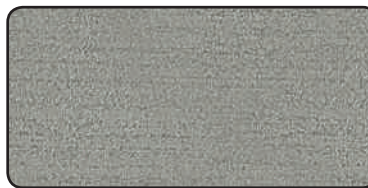
Shale Grey ●●