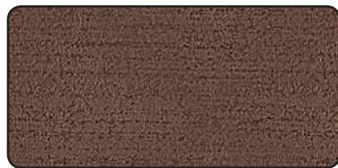
Coffee Brown ●●