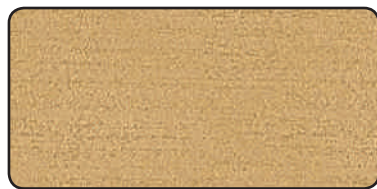
Harvest Gold ●