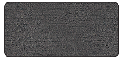
Storm Grey ●●