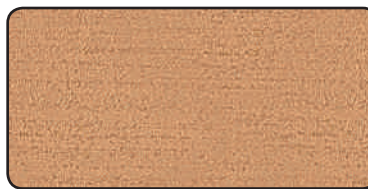
Western Sand ●