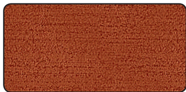
Brick Red ●