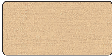
Sandy Beige ●●

Hi-Tech's range of colours allows you to compliment or contrast with your surroundings, to create stunning looks limited only by your imagination.