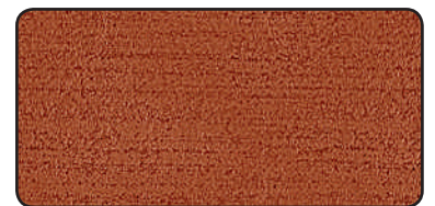
Burnt Orange ●